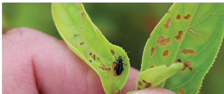
Red headed flea beetle damage